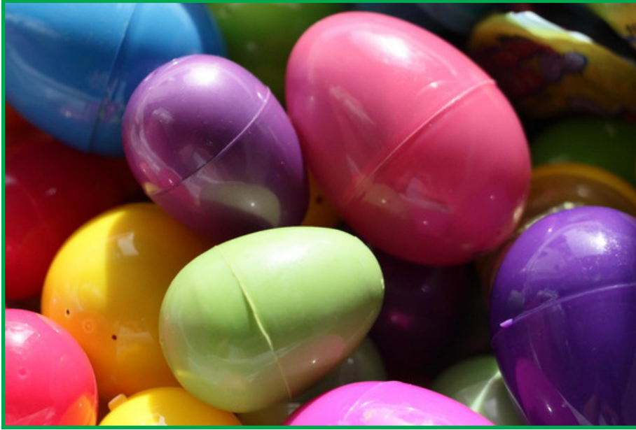
Join our 4th Annual Adult Flashlight Egg Hunt -Details on Page 6