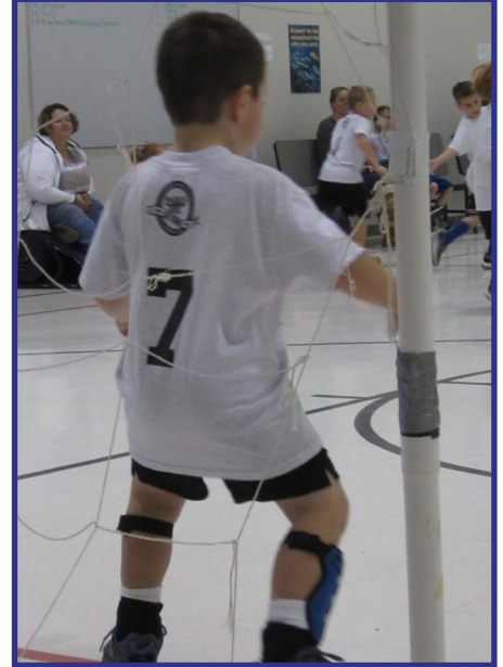
See Pee Wee Soccer, Page 3