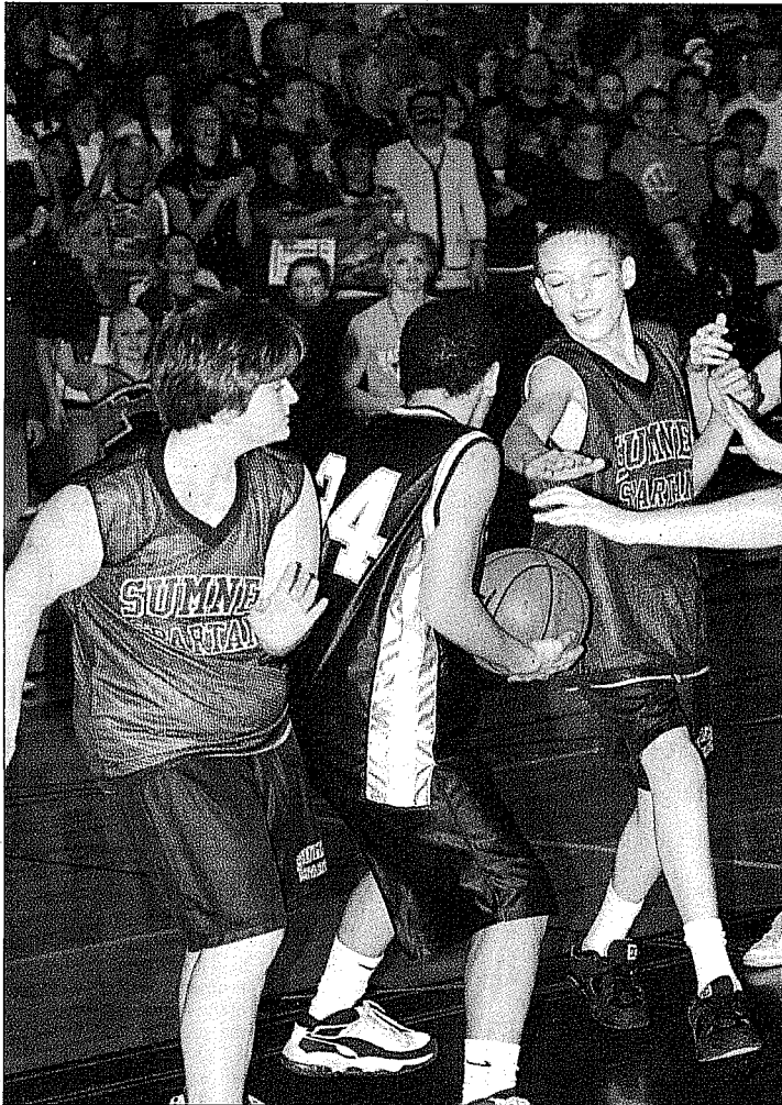
To view or buy photos go to www.courierherald.com